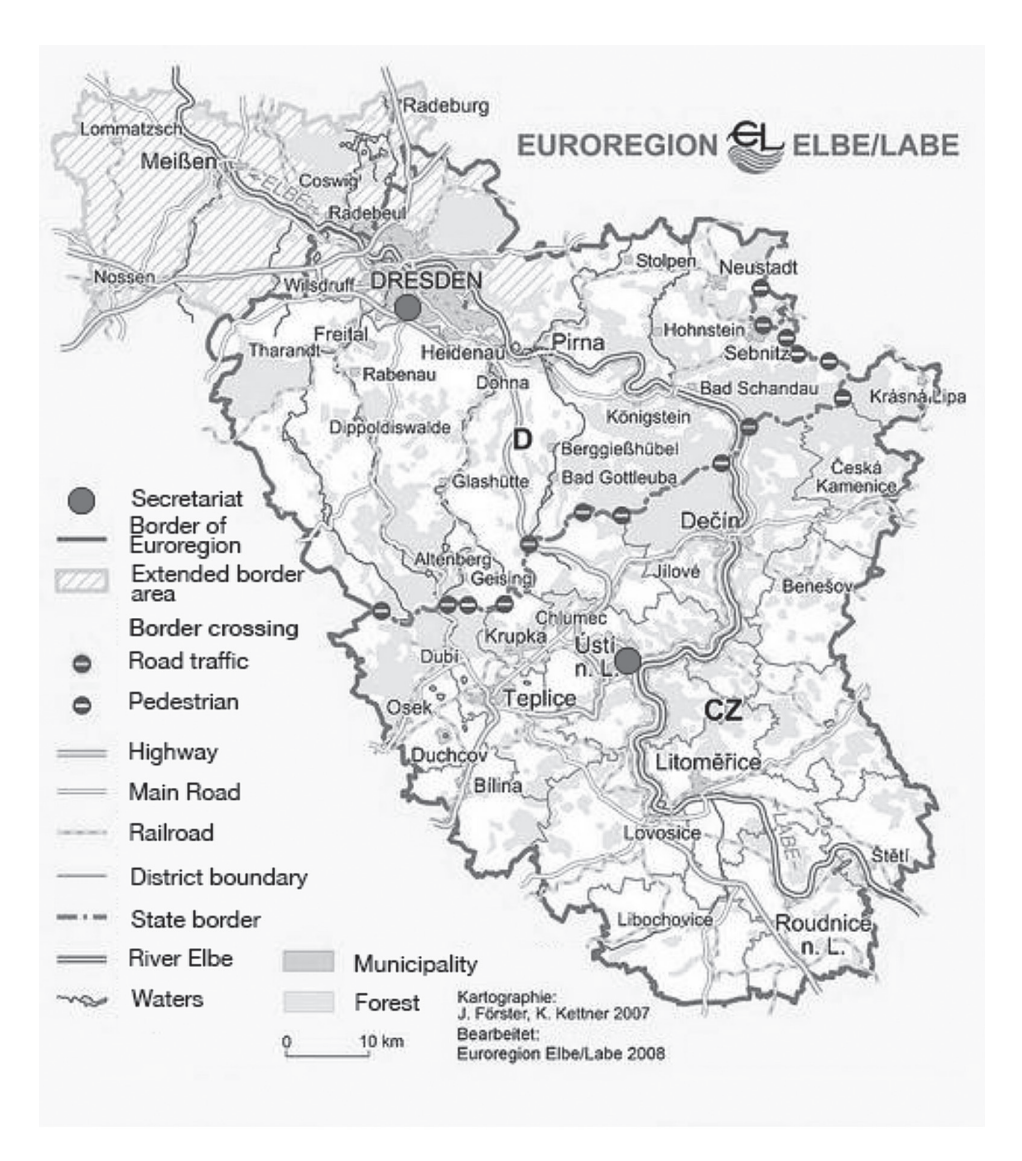
Figure 1: Map of the case study region (Euroregion Elbe-Labe) (Adapted from Euroregion Elbe/Labe (2008) with author's own additions)

In the case study region, two political and administrative structures meet. Germany is a decentralized federal country where individual states (Länder) have a high degree of autonomy. After German reunification in 1990, Saxony quickly implemented a system of governance and institutional arrangements common in former West Germany and followed a path of decentralizing political power and administration functions (Wollmann 1997). Although in the Czech Republic there was the creation and empowerment of the regional administrative level at the turn of the millennium in connection to EU enlargement, it was rather formal, as was the case in other Central European countries (Pálné Kovács 2009). In fact, the Czech Republic is still a relatively centralized state where the majority of competencies is kept at